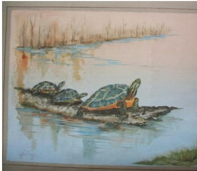
Turtles Marsh Reflections