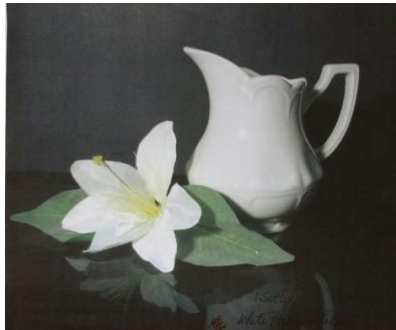
White Pitcher and Lily

The cost of the seminar is $50 per day, with a $10 discount if a student signs up for both days, for a weekend total of just $90. To register for one or both days, please complete the form below, enclose a check made out to TCDP , and send it all to Wendy Cornman.